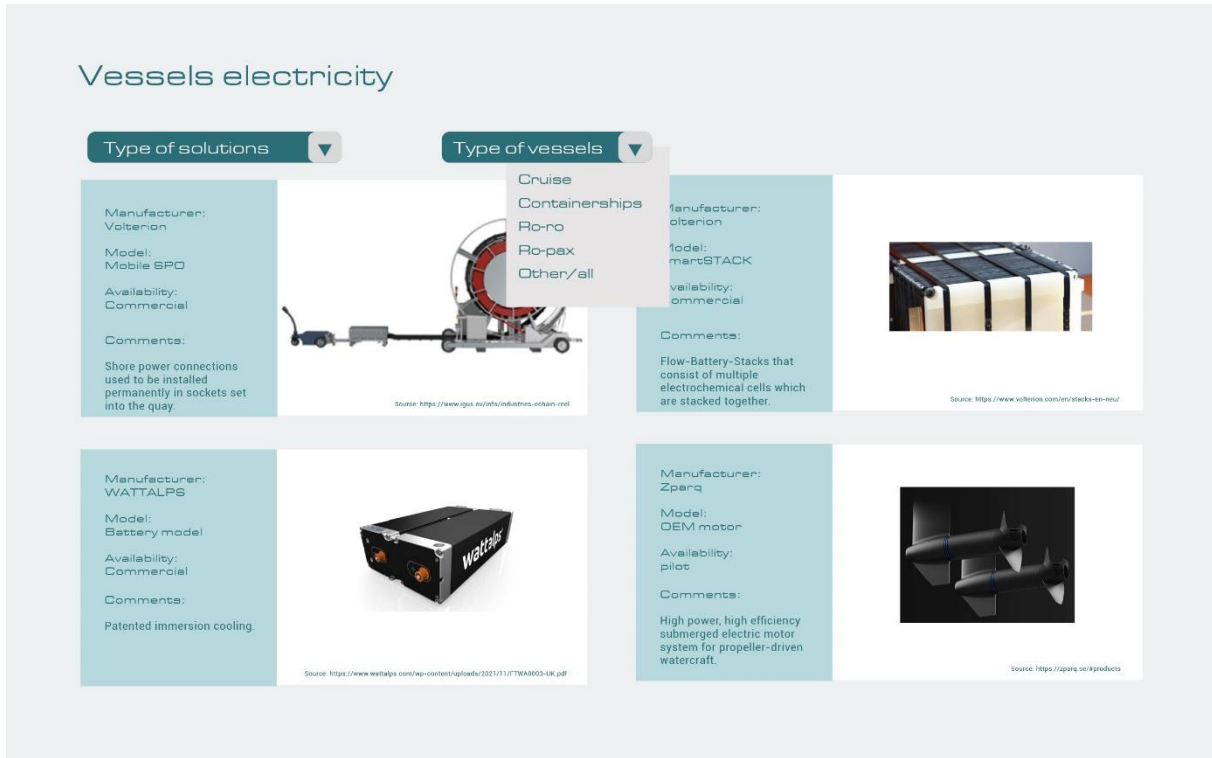
Figure 2: Sample of vessels' electricity section

Once a solution is selected, a new interface will show up with filters, allowing users to select different characteristics to obtain the technologies, as exemplified in the image below: